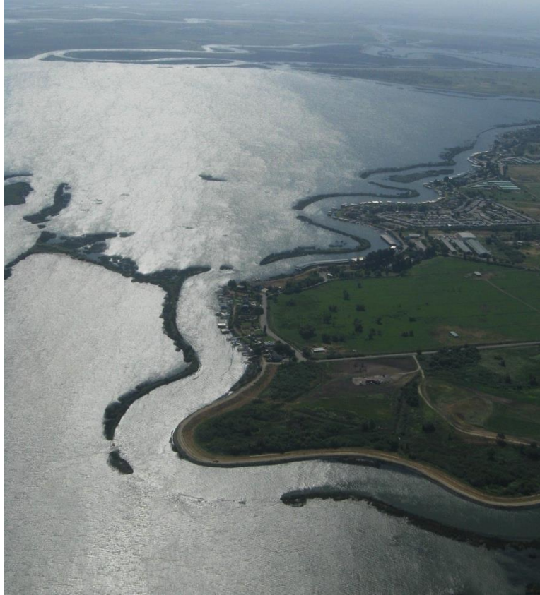
Frank's Tract, May 22, 2009. Large expanses of open water are likely to increase in the Delta, one of the justifications for WaterFix.