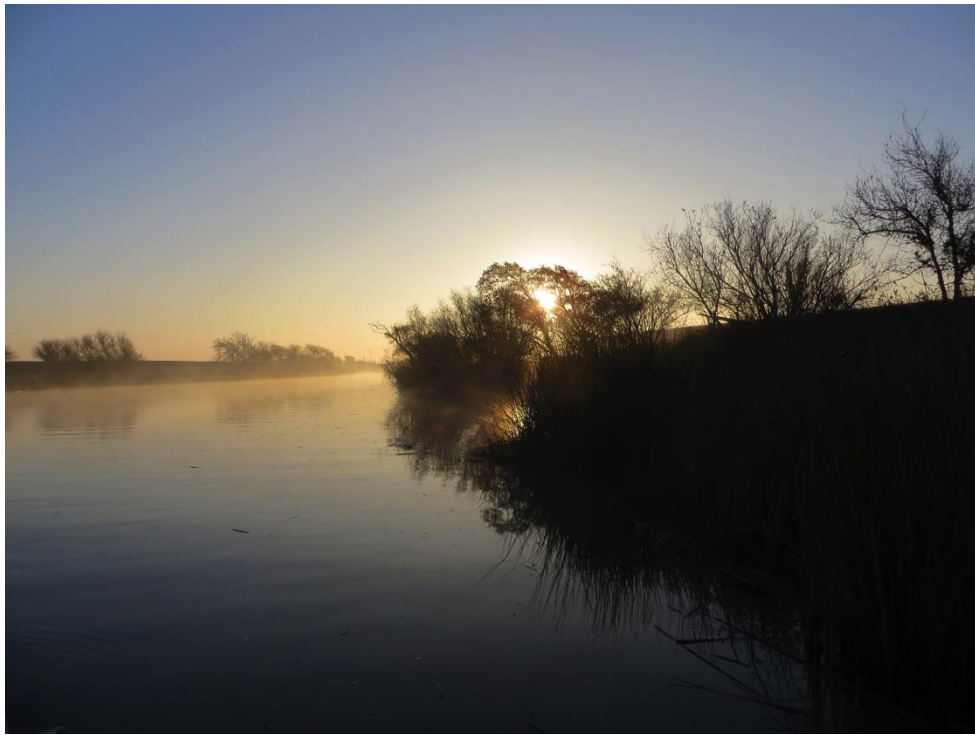
Cache Slough Sunrise.

Appendix E. A Scoring System for Restoration Projects