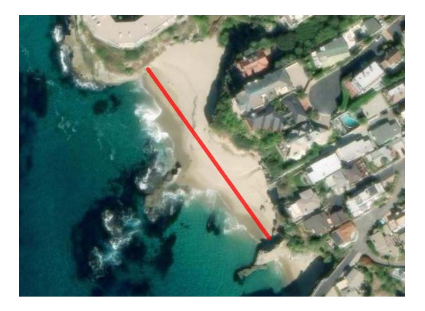
Table Rock Beach